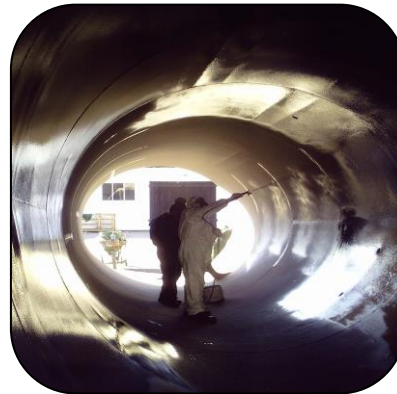
Paper plant chimney operating at 100°C with traces of sulphuric acid coated with 206 Ceramic HTA Fluid