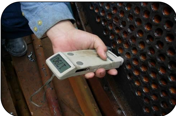
Tube sheet resurfaced using 206 Ceramic HTA Fluid