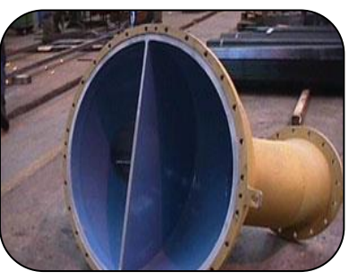
Process pipework abrasive blast cleaned and coated with 203 Super Flow