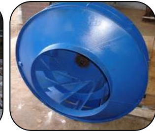
Hot air fan, abrasive blast cleaned and coated with 203 Super Flow