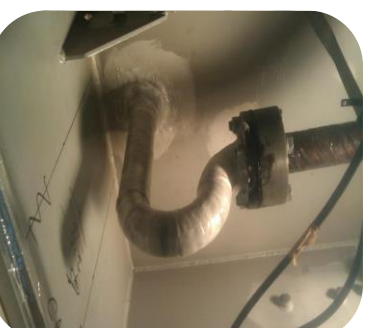
Accommodation area waste water pipes were leaking at the welded joints. Over 60 bends and joins wrapped using 301 standard resin and hardener and glass tape